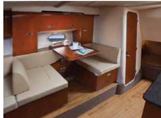
Open and atmospheric, the cabin can sleep up to six people in its V-berth, convertible dinette (shown here), and mid-berth. Wood flooring is standard.