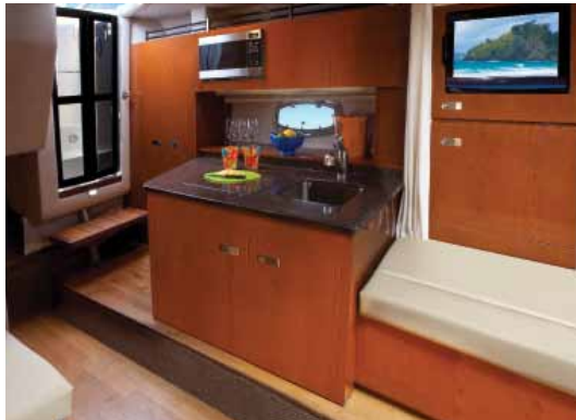
The handsome galley features a solid-surface countertop, microwave, refrigerator, single-burner stove with cover, and stainless-steel sink.