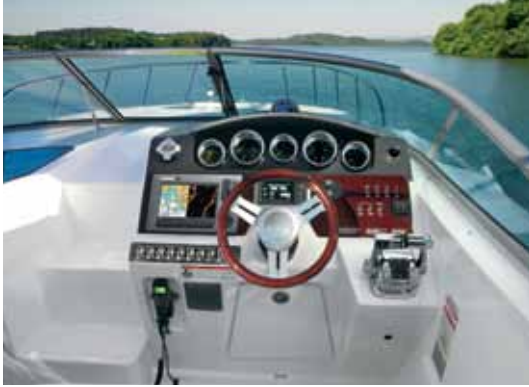
The sporty helm station features SmartCraft® instrumentation with engine diagnostics, as well as a VHF radio and room for optional electronics.

The epitome of elegance, luxury, and grace, this magnificent express cruiser is the ultimate reward for a lifetime of excellence. Upscale features in the 310 Sundancer include state-of-the-art navigational technology, an airy cabin with extra-large windows, and an amazing amount of storage space.