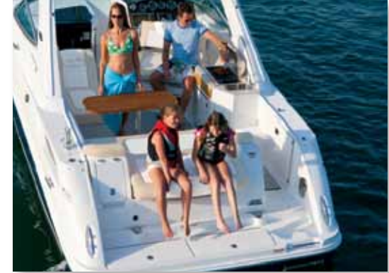
The fold-down transom seat/sun pad adds versatility to the cockpit and standard extended swim platform.