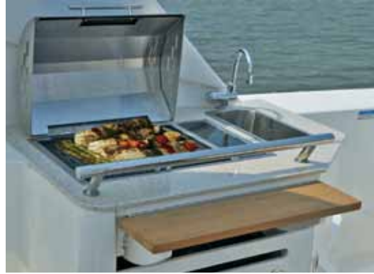
A cockpit wet bar includes a solid-surface countertop and space for an optional built-in grill and flip-up table extension.