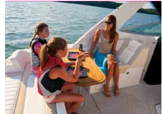
An L-shaped cockpit lounge and removable teak table with dedicated storage make entertaining guests a breeze aboard the 310.