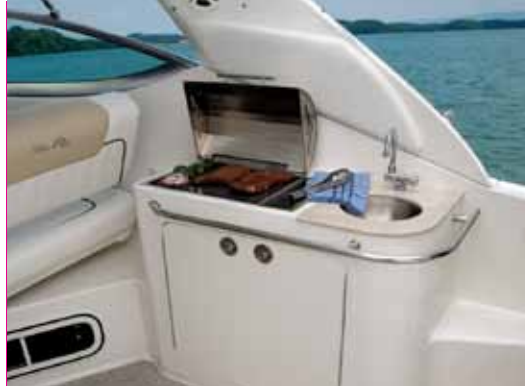
An elegant cockpit wet bar features a Corian® countertop and stainless- steel faucet, plus an optional barbeque grill.