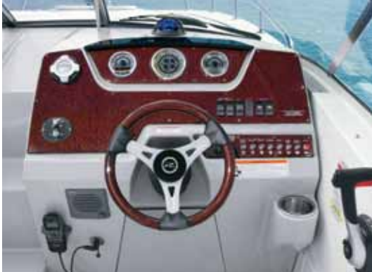
The ergonomically designed helm has clear sight lines and puts all the controls within reach.

The sleek, contemporary lines of the 280 Sundancer make it a standout in any marina, but this express cruiser is not meant to sit at the dock. A dynamic deep-V hull provides a smooth ride in any conditions, while the stylish interior promises comfortable overnight stays.