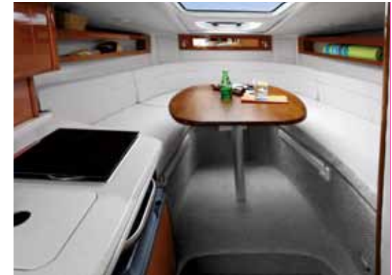
Rich textures and designer fabrics make this roomy dinette/V-berth attractive and comfortable.

ABYC Sponsor of ABYC Marine Certification School