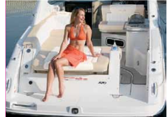
The 280 has an innovative transom bench that converts to a sun pad.