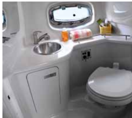
This comfortable head and shower compartment is fully enclosed and features a sink, vanity, and VacuFlush® head.