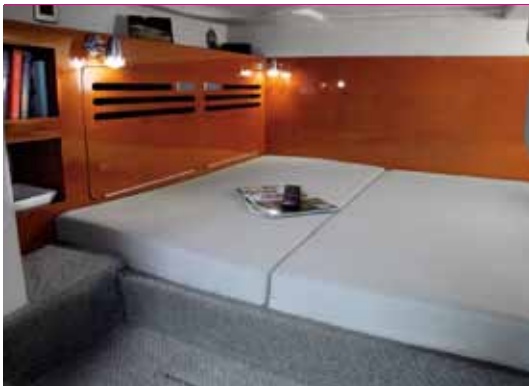
Your guests will enjoy plenty of room in the mid-stateroom with double berth, built-in storage cabinet, and sliding window with screen.